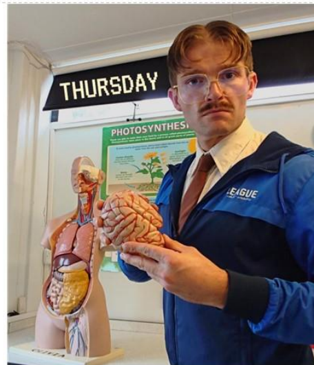
Ah, that's where I left my brain!