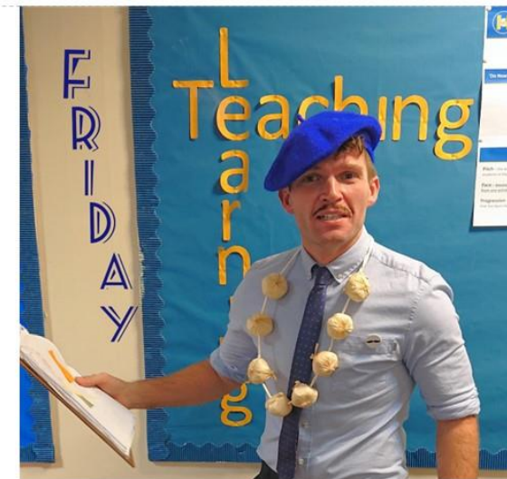
Can the guy 'baguette' any more ridiculous?