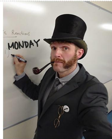
I moustache you a question...?