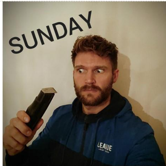
Here we go!