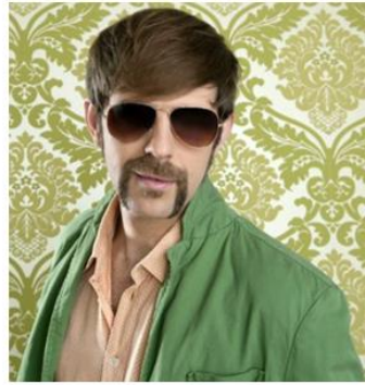
The Trucker - £500