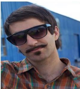
The Jeremy - £250