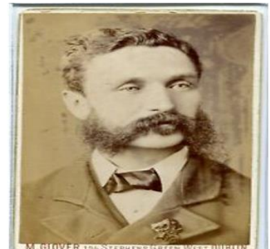
The Victorian Gentleman - £600