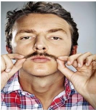
The Artist - £400

We have set up a just giving page to support two charities: The Campaign Against Living Miserably (CALM) which is a leading movement against suicide, the biggest killer of men under the age of 45 in the UK and The Hospice in the Weald which provides care completely free of charge to patients with terminal illness. We are asking our families and the wider Hayesbrook community to make a donation to help support these amazing charities – when the donations are tallied up on 23 Movember, depending on how much we raise will determine the style the staff must shape their tash into! See the array of styles below: