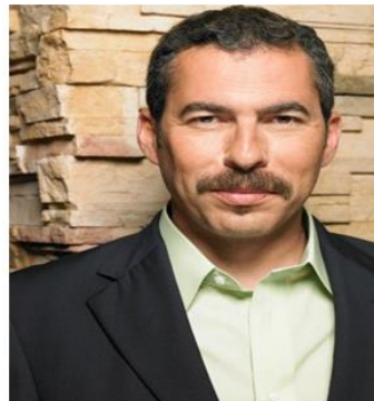
The Magnum - £450